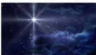
Watchnight Service- 24 December 2022

During the last 18 months the various new initiatives that resulted from the initial lockdown experience of 2020 have been further nurtured and developed, building on the momentum generated during the preceding financial year.