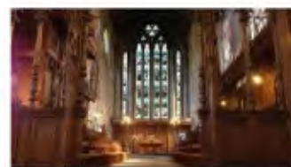
Sunday Morning Service- 24 July 2022

Digital services of worship remain second nature for many, both in terms of delivery and in terms of participation. The choir has continued to enhance their contribution to online services. As well as routinely broadcasting worship online on a Sunday morning throughout the period, there have also been special online services at Christmas and Easter, a Cathedral Kids Nativity Service, and Advent Reflections. Weekly “Prayers for Ukraine” have also been held since the outbreak of the crisis in Ukraine. A group continue to explore the options for potentially developing live streaming of services, and it is expected that this will be introduced in 2023.