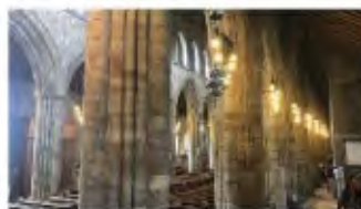
Sunday Morning Service- 16 October 2022